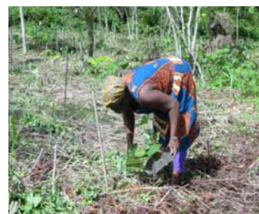
A woman planting cocoa seed

Everything in the natural world is connected – living and non-living. Every species affects the lives of those around it. An ecosystem is a community of living and non-living things that interact and affect one another. It has no particular size - it can be as large as a desert or a lake or as small as a tree or a puddle.