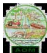
Ministry of Agriculture Liberia