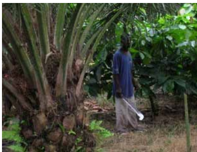
A farmer holding a cutlass

All over Africa farmers have used their experiences over centuries to develop farming systems that yield good economic returns and also keep the environment in a good state.