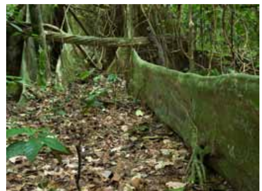
Buttress roots of tropical tree

Wherever there is life, there is biodiversity. It exists in the largest cities and your own farm and backyard. Even where humans have difficulties surviving such as in the frozen Arctic or dry deserts areas, other species live. Tropical habitats contain a large number of species and the relationship between the species is complex. Other habitats