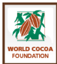
World Cocoa Foundation