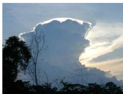
A typical cloudy day in Liberia