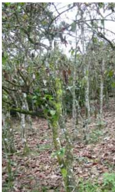
Pest infested cocoa farm

When crops and animals are protected against these harsh weather conditions, yield is increased and losses reduced. Farmers influence microclimate by retaining and planting trees which reduce temperature, wind speed, evaporation and direct exposure to sunlight, and intercept rain. Farmers also use mulch to reduce excessive heat from the sun on soil surfaces and reduce soil moisture losses.