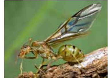
Weaver ant ( Oecophylla longinoda )

The word biodiversity is the short form of the term 'biological diversity' . Biodiversity is the variety of all living things on Earth. This includes the millions of species (people too) that live on land, freshwater systems and oceans. It also includes the tiny organisms that we can see only with a microscope as well as fungi, plants, the trees, ants, beetles, butterflies, birds and the large animals (elephants, whales, bears, etc).