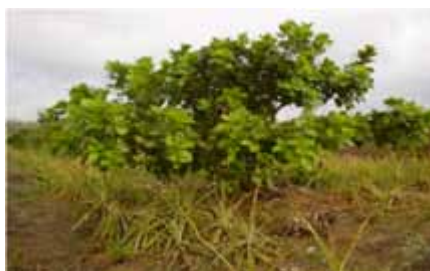
Alley cropping of a tree crop with an arable crop

Some farmers plant two or more crops on the same piece of land. By so doing they maximize available land space and this helps to reduce soil erosion and increase the different kinds of plants on the land. When farmers allow some crops to remain on the land after others are harvested, soil erosion is checked. Erosion can damage the quality of rivers, streams and lakes through deposits of sediments. It can also damage the places where fishes lay and hatch eggs.