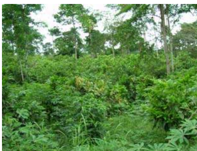
A cocoa farm with different plant species

Agroforestry is a land-use system in which trees, shrubs, palms and bamboos are deliberately planted together with agricultural crops or on grazing land. For example, farmers in most parts of Africa, keep a number of forest tree species, fruit trees and shrubs on their farms. These trees provide fruit, fuel and fodder, give shelter to birds and animals, improve soil fertility and maintains the general ecosystem of the farm. A shaded cocoa farm for example supports up to 180 species of birds that help control insect pests and disperse seeds.