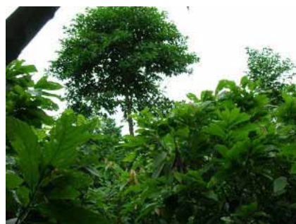
A young IPM cocoa farm