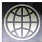
The World Bank East Nimba Nature Reserve (ENNR)