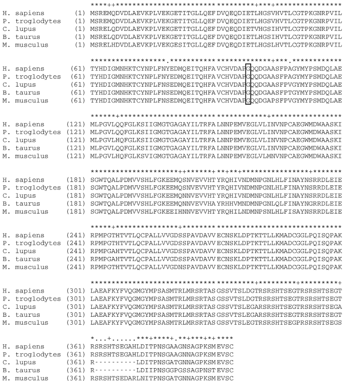
Figure 2. Multiple alignment of mammalian NDRG1 proteins. Alignment of NDRG1 protein sequences from five mammalian species: Homo sapiens, Pan troglodytes, Canis lupus, Bos taurus and Mus musculus shows a sequence similarity of 94.7%. Residue 98 (gly, marked with a frame) which is substituted in Alaskan Malamutes with the G>T mutation, is conserved in the five species. doi:10.1371/journal.pone.0054547.g002

the wild type allele (except for 13, which were heterozygous). This is in concordance with autosomal recessive inheritance and also supports the result of the test mating made in Norway in 1983 [10]. Moreover, the fact that NDRG1 is also mutated in Greyhounds and humans with some forms of polyneuropathy supports the hypothesis that the G>T substitution causes AMPN. If this SNP did not cause disease, it might have existed in other breeds as well. However, it was not detected in any of the 201 dogs representing 38 other breeds. The four Alaskan Malamutes with polyneuropathy with other aetiologies than AMPN illustrate that phenocopies have to be taken into consideration also with this disease. One could speculate that this mutation is not causative but