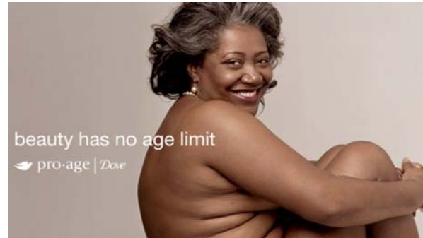
Figure 2. Dove.

Convergent and divergent marketing are not absolute concepts. A marketing campaign can be convergent or divergent to a greater or lesser degree. Moreover, a campaign might incorporate elements