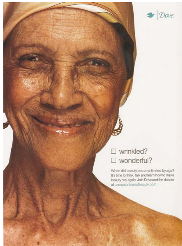
Figure 6. Dove.

Two things are decisive about these ads. On the one hand, Dove explicitly encourages the persons exposed to the ads to reflect upon the relation between beauty, age, and being wrinkled. (In another set of ads, they invite us to reflect on the relation between body-size and attractiveness). On the other hand, Dove is not just facilitating a debate; they are