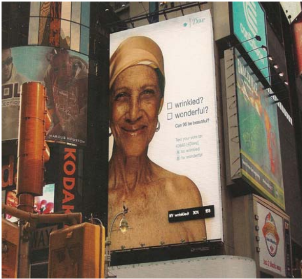
Figure 7. Dove.

active players who take a stance. Their official mission is to change the way society views beauty to create a more inclusive ideal of beauty that does not thwart women's self-esteem. Dove is actually trying to make a new and more inclusive ideal of beauty.