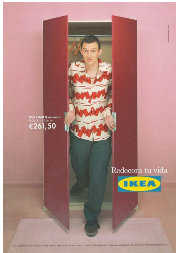
Figure 3. Ikea.

Dove’s “Campaign for Real Beauty” is probably one of the most clear-cut examples of divergent marketing, but the very enterprise of divergent marketing is by no means a rarity. Ikea launched a marketing campaign in Spain, which encourages people to break the societal rules that govern our use of colors and patterns, among others, by encouraging men to use “women-colors” such as red, cherry, and pink (see Figure 3). In a marketing campaign consisting of national flags, in which the colors on the various flags symbolize a striking social or political issue, the Portuguese news magazine Grande Reportagem invites the consumer to reflect on political issues such as just distribution (see Figure 4). The black and the red colors that take up the majority of the space on the flag represent people infected by HIV and malaria. The tiny bit of yellow represents people with access to medical care. United Colors of Benetton has won a number of awards for their thought-provoking campaigns that clearly intend to make the consumer reflect on social, cultural, and political issues. One telling example is the “Angel and Devil” campaign featuring a white girl and a black boy. The black boy’s hair is styled into horns, thereby establishing a direct reference to the Devil. The campaign obviously intends to confront cultural prejudice and make the consumer reflect on and evaluate his or her actual beliefs (see Figure 5).