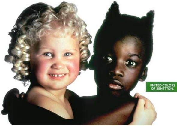
Figure 5. Benetton.

value universe, as would have been the case with convergent marketing.