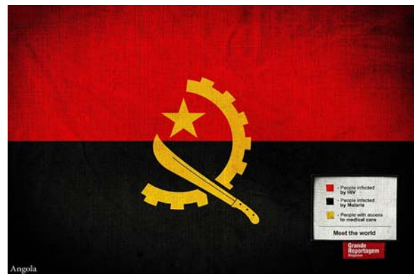
Figure 4. Grande Reportagem.

All of above mentioned marketing campaigns are instances of divergent marketing because they either try to break down or confront existing cultural values rather than just affirm the consumer’s actual