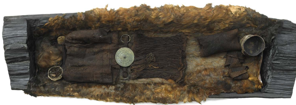
Figure 2. A photo of the remains of a Bronze Age high status female found inside an oak-coffin in a monumental burial barrow at Egtved, Denmark. The Egtved Girl's garments are extremely well preserved and her exceptional wool costume consists of several wool textile pieces as well as a disc-shaped bronze belt plate, symbolizing the sun.