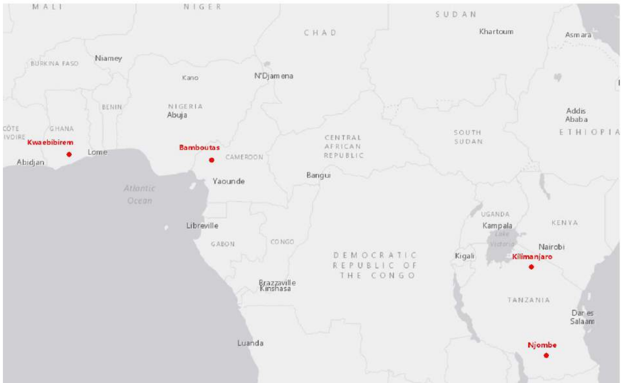
Figure 1: Location of study sites across East and West Africa.