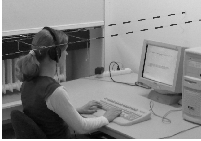
Figure 1.: Experimental setting. The dashed lines indicate the rope construction used to secure a fixed distance between the participant and the screen.