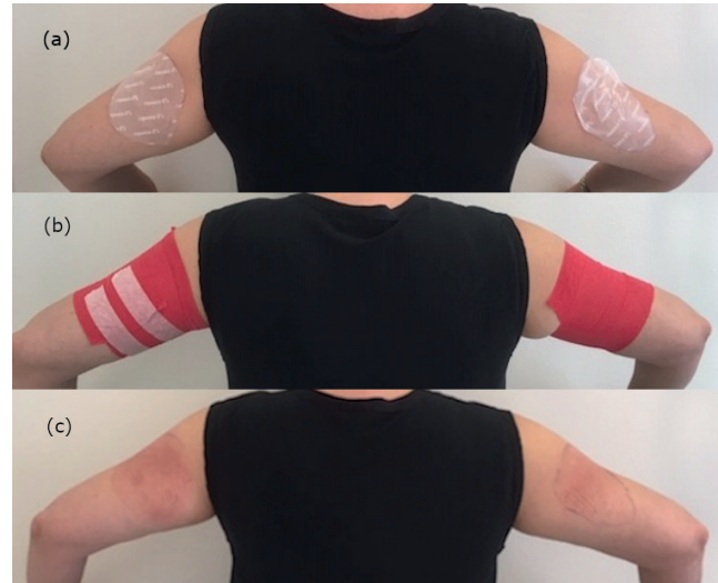
Fig. 1. Areas with touch-evoked itch were identified and (a) patches were cut to cover the areas and (b) applied for 1 h under bandage occlusion. (c) Subsequent erythema of the treated areas of skin.

In April 2018, the patient received the first off-label treatment with a Qutenza ® 8% capsaicin patch. On her right upper arm, the area with touch-evoked itch (alloknesis) was identified and marked with a pen. The patch was cut with a pair of scissors to cover the area and applied for 1 h under bandage occlusion. After removal, the area was wiped with a cleansing gel and washed with water (Fig. 1).