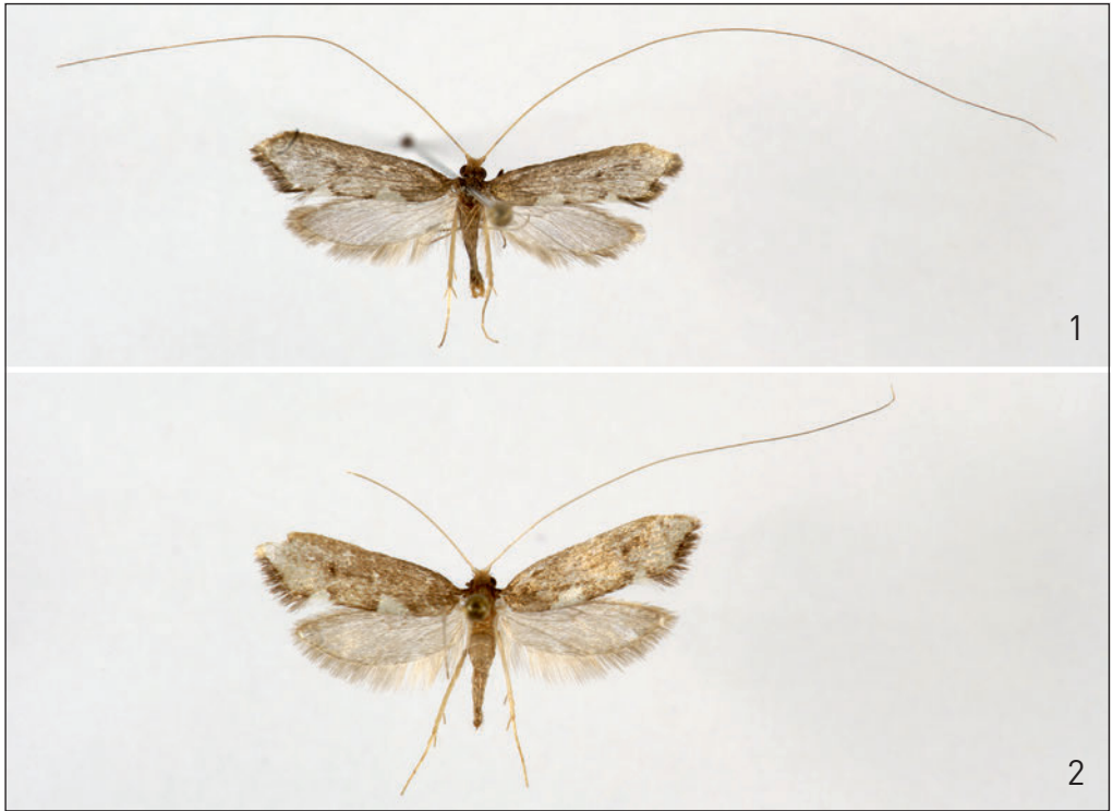
Figs 1, 2. Nematopogon stenochlora . 1. female, Spain, prov. Malaga, Marbella, El Mirador, 3.ii.1984; 2. male, Spain, prov. Malaga, Casares, 9.ii.2003.

and Spain); discal spot absent in light specimens (e.g. in syntypes) but present in dark specimens (e.g. those collected in Spain). Cilia from pale ochreous, indistinguishable from forewing colour (e.g. in syntypes) to dark brown, clearly contrasting to forewing background (e.g. in specimens collected in Spain). Light marks on dorsal margin of forewing greatly variable. The tornal mark is always present, although minor (a few scales) and almost indistinguishable in light specimens (e.g. in syntypes); however, even in these extreme situations the light colour of cilia marks its occurrence (this can be seen even in the paralectotype, see Nielsen 1985: 17, fig. 25). The proximal mark (located at approx. 1/3 of forewing length) is absent in most specimens from Algeria, although traces of it are present in two specimens from Constantine; in contrast, this mark is very distinct (reaching 0.15 \times forewing length and 0.20 \times forewing width) in specimens from Spain. Hindwing sparsely scaled, semi-translucent, from pale greyish to light brown. Legs light brown. Epiphysis at 0.3 , not reaching apex of tibia. Abdomen greyish brown.