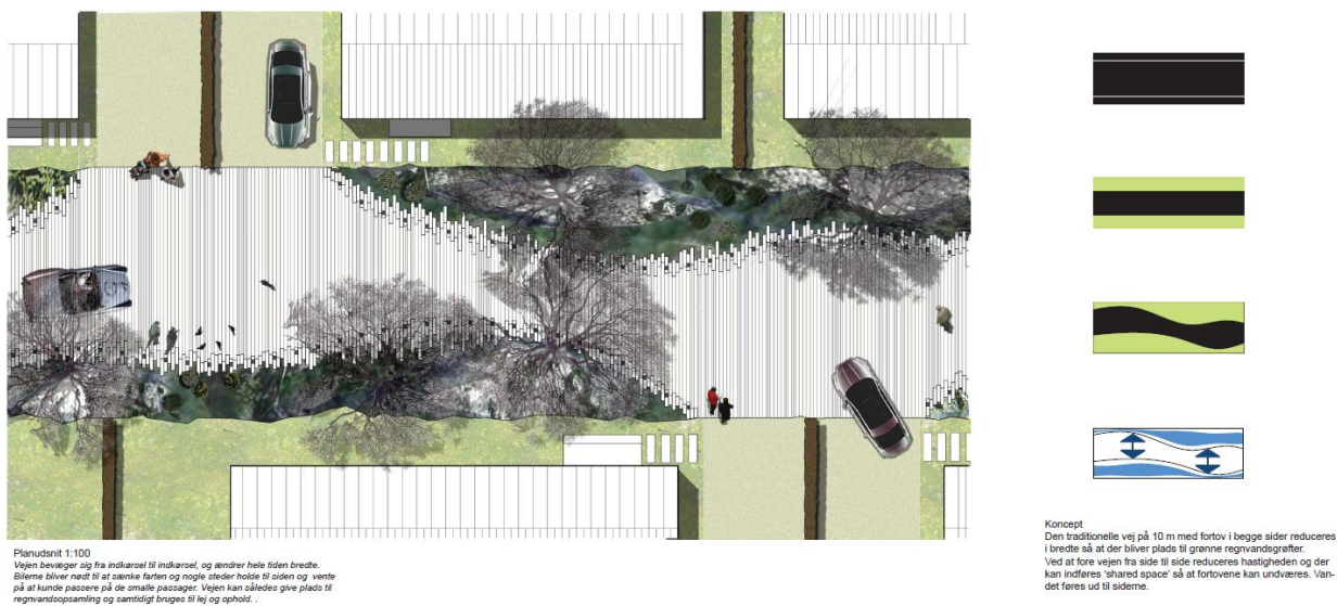
Figure 3: The neighbourhood streets with contemporary values open for the interest of decision makers in the field of paving materials.