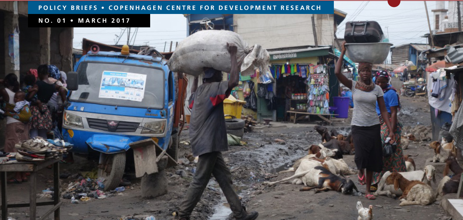
Street scene in Old Fadama.