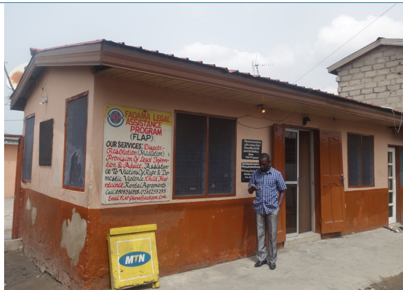
OFADA member and informal service provider, Old Fadama.

up on complaints of theft and damage to property; pursuing disagreements over rental payments; giving newcomers advice on building; checking up on low-lying areas after heavy rainfall; and rallying communal labour to clear blocked waterways.