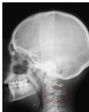
Figure 2 Illustration of fusion between the second and third vertebrae at the articular facet marked by circle.

Regarding the craniofacial dimensions, the effect of age was assessed by linear regression analysis and for the occurrence of morphological deviations of the cervical column by logistic regression analysis. Differences in means of the craniofacial dimensions and number of tooth agenesis between genders and between the groups were assessed by unpaired t test. Differences in tooth agenesis pattern between genders and between the groups were assessed by Fisher's exact test. Associations between tooth agenesis and craniofacial morphology and the possible effect of age and gender