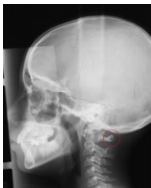
Figure 1 Illustration of partial cleft of C1 marked by circle.

points were digitalized on cephalograms using the TIOPS™ software (Tiops 2005, Version 2.12.4) and nine angular measurements were measured according to Siersbæk-Nielsen et al. [19] . Because the cephalograms were not scanned in a 1:1 scale, the overbite and overjet was measured by hand on analog cephalograms and taking into account the magnification of 5.6%. The points and lines are illustrated in Figure 3 and the mean values are shown in Table 1.