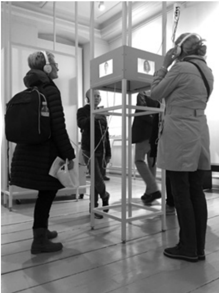
FIG. 1. EYE TO EYE WITH FOUR DIFFERENT PERSPECTIVES ON GASTRIC BYPASS SURGERY. VISITORS TO OBESITY: WHAT'S THE PROBLEM? CAN LISTEN TO INTERVIEWS WITH A MEDICAL DOCTOR, A SURGEON, A RESEARCHER AND A PATIENT TALKING ABOUT DIFFERENT ASPECTS OF THE OPERATION.

This material story of bariatric surgery shows that research is guided not just by hypotheses but also by observations from clinicians and patients: by sometimes surprising findings that challenge core concepts such as obesity and weight loss. The exhibition also contains short interviews with a doctor, surgeon, gastric bypass recipient and hormone researcher (Fig. 1). Again, differences of focus and understanding sit alongside each other without being resolved – visitors are invited to find their own position within the field, and we have informally observed many visitors sharing stories from their own experience at this installation.