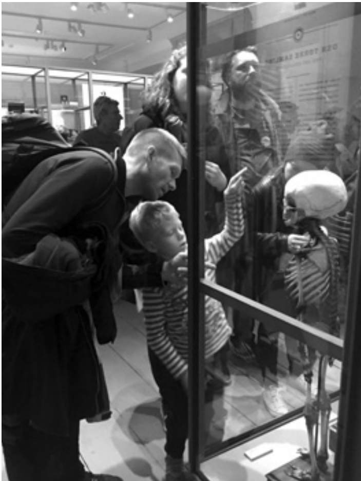
FIG. 4. VISITORS TO THE BODY COLLECTED ARE CONFRONTED WITH THE MEDICALIZED BODY, AND IN CONTEMPLATING IT DRAW ON THEIR OWN WAYS OF COPING WITH THE BEAUTY, STRENGTH, FRAGILITY AND MORTALITY OF OUR PHYSICAL BODIES.

The exhibition shows the use of the body primarily from medical points of view. At the same time, it opens itself to a wide range of responses, and we know from comments at guided tours and interviews that the exhibition triggers personal, ethical, cultural and existential reflections. Such discussions are not included in the exhibition texts, which only very lightly touch on issues such as who was collected and how we should use dead bodies. This is in recognition of the fact that each visitor will come with his or her own cultural perspectives and views on the relationship between medicine, the body, life and death. The exhibition is a venue for showing that medical science has its own particular cultures, which being inscribed in the broader cultural space of the museum are made open for reflection and debate.