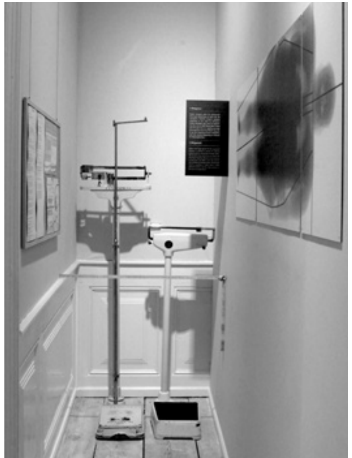
FIG. 2. A DISPLAY ABOUT THE DIAGNOSIS OF MORBID OBESITY IS SITUATED IN A NATURALLY NARROW SPACE, ENCOURAGING VISITORS TO BE CONSCIOUS OF THE SIZE OF THEIR OWN BODIES. UNTIL RECENTLY A STANDARD SCALE COULD ONLY WEIGH UP TO 150 KG, AND TWO SCALES WERE THEREFORE NEEDED FOR SOME PEOPLE.

The exhibition deliberately avoids showing whole human bodies. The only image is the full-sized reproduction of a scan of a woman diagnosed with