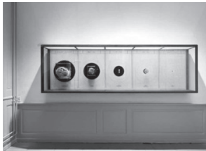
FIG. 3. THE FOCUS OF MEDICAL INVESTIGATIONS OF THE HUMAN BODY FROM THE LATE 18TH CENTURY TO DATE IS DISPLAYED AS A REDUCTIVE SCALE, FROM THE WHOLE HUMAN TO ITS MOLECULES IN THE BODY COLLECTED. BUT NO SIMPLE BUILDING BLOCKS OF HEALTH AND DISEASE HAVE BEEN FOUND.

In the exhibition, the reductive drive of medicine is tempered by peepholes into the personal stories behind the specimens. Little information is preserved about the people whose bodies became part of medical collections, but sometimes we know more. One example is the story of the conjoined twins Martha and Marie, who were nursed and cared for