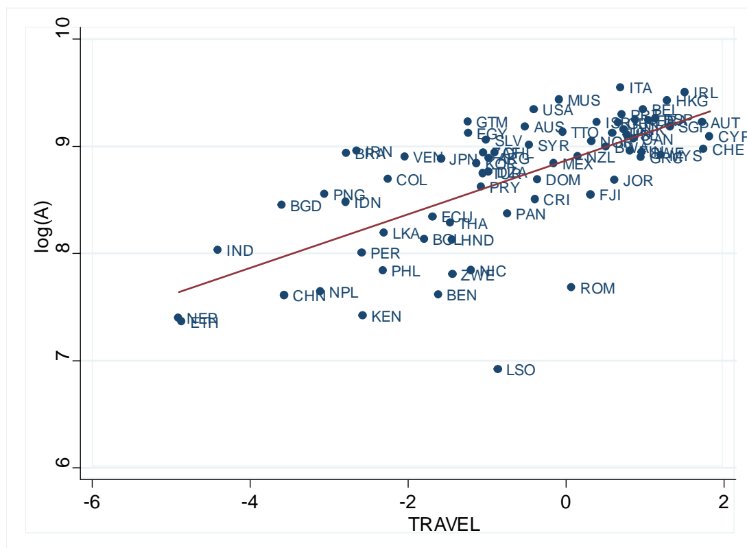
Figure 1. TRAVEL vs. log(A) (72 countries).

Notes: (AGO) Angola, (ARG) Argentina, (AUS) Australia, (AUT) Austria, (BDI) Burundi, (BEL) Belgium, (BEN) Benin, (BGD) Bangladesh, (BOL) Bolivia, (BRA) Brazil, (BWA) Botswana, (CAN) Canada, (CHE) Switzerland, (CHL) Chile, (CHN) China, (CIV) Cote d'Ivoire, (COL) Colombia, (CRI) Costa Rica, (CYP) Cyprus, (DNK) Denmark, (DOM) Dominican Republic, (DZA) Algeria, (ECU) Ecuador, (EGY) Egypt, (ESP) Spain, (ETH) Ethiopia, (FIN) Finland, (FJI) Fiji, (FRA) France, (GBR) United Kingdom, (GRC) Greece, (GTM) Guatemala, (HKG) Hong Kong, China, (HND) Honduras, (HUN) Hungary, (IDN) Indonesia, (IND) India, (IRL) Ireland, (IRN) Iran, (ISL) Iceland, (ISR) Israel, (ITA) Italy, (JOR) Jordan, (JPN) Japan, (KEN) Kenya, (KOR) Korea, Rep., (LKA) Sri Lanka, (LSO) Lesotho, (MAR) Morocco, (MDG) Madagascar, (MEX) Mexico, (MUS) Mauritius, (MYS) Malaysia, (NER) Niger, (NGA) Nigeria, (NIC) Nicaragua, (NLD) Netherlands, (NOR) Norway, (NPL) Nepal, (NZL) New Zealand, (PAN) Panama, (PER) Peru, (PHL) Philippines, (PNG) Papua New Guinea, (PRT) Portugal, (PRY) Paraguay, (ROM) Romania, (SGP) Singapore, (SLV) El Salvador, (SWE) Sweden, (SYR) Syrian Arab Republic, (TCD) Chad, (THA) Thailand, (TTO) Trinidad and Tobago, (TUN) Tunisia, (TUR) Turkey, (TZA) Tanzania, (USA) United States, (VEN) Venezuela, (ZAF) South Africa, (ZWE) Zimbabwe.