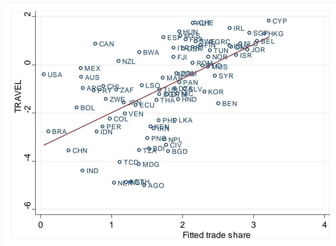
Figure 3. Fitted trade share vs. TRAVEL (72 countries). Notes: See Figure 1 for the key to country codes.